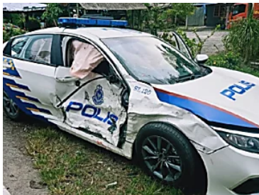
4WD driver rams into police patrol car, 3 cops injured | New Straits Times New Straits Times