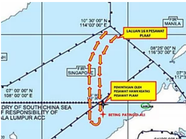
NST Leader: Plane truth | New Straits Times New Straits Times