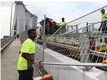
Singapore's entry ban on India worsens COVID labor crunch Sponsored | Nikkei Asia