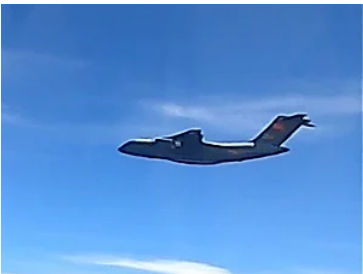
Dr M: Malaysia, China will not antagonise over airspace intrusion | New... New Straits Times