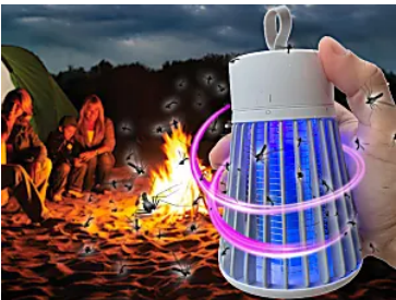
New Anti-Mosquito Device Is Taking Malaysia By Storm Sponsored | simplifiediscountfind...